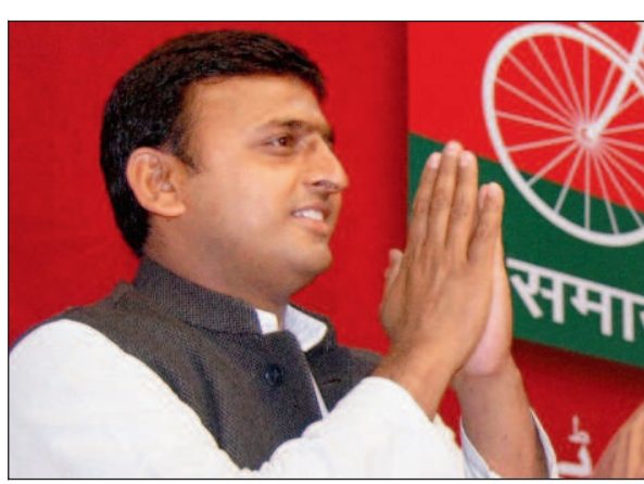
SP'S NEW NETAJI? Akhilesh Yadav

who is now all set to be the state's youngest CM. Disregarding murmurs of protests from party old-timers who are opposed to the leadership of Akhilesh, Mulayam convened a late-night meeting at his home to iron out the differences and work out a compromise formula ahead of Saturday's meet.