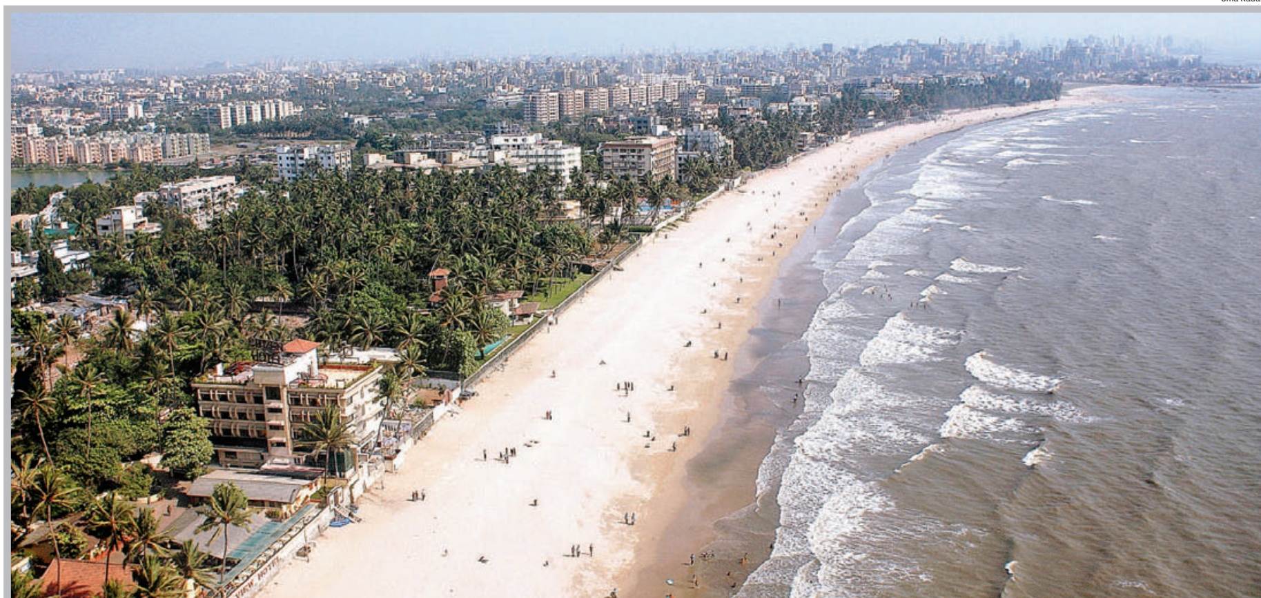
COAST IS CLEAR: Residents and activists fought a long, hard battle to restore Juhu beach to being a vital open space for the public. However, as the pictures at right show, the fight never ends as they have to constantly monitor the beach because of the temporary, illegal stalls that constantly crop up in violation of court orders