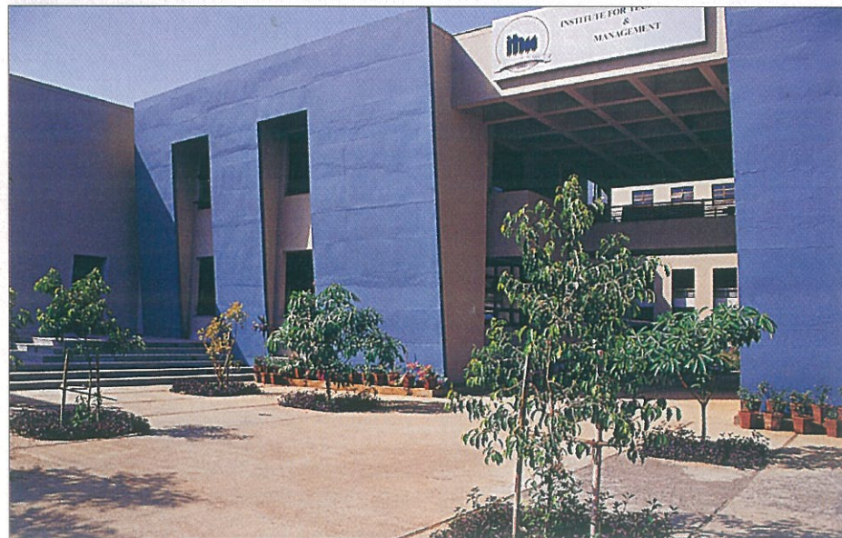
PK Das's Institute for Technology and Management