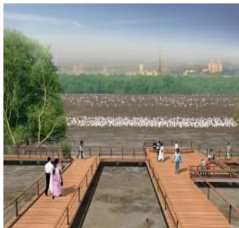
Integrating wetlands in Mumbai.

Being on the waterfronts and bathing in the sheer beauty and vast expanse of openness extending up to the horizon, in dense city landscapes, is truly liberating. But, increasing attempts to colonize these common assets for private and exclusive consumption is steadfastly eroding larger public interest and undermining ecological and environmental interests too—all this besides capturing the very experiences of this openness and natural beauty for few.